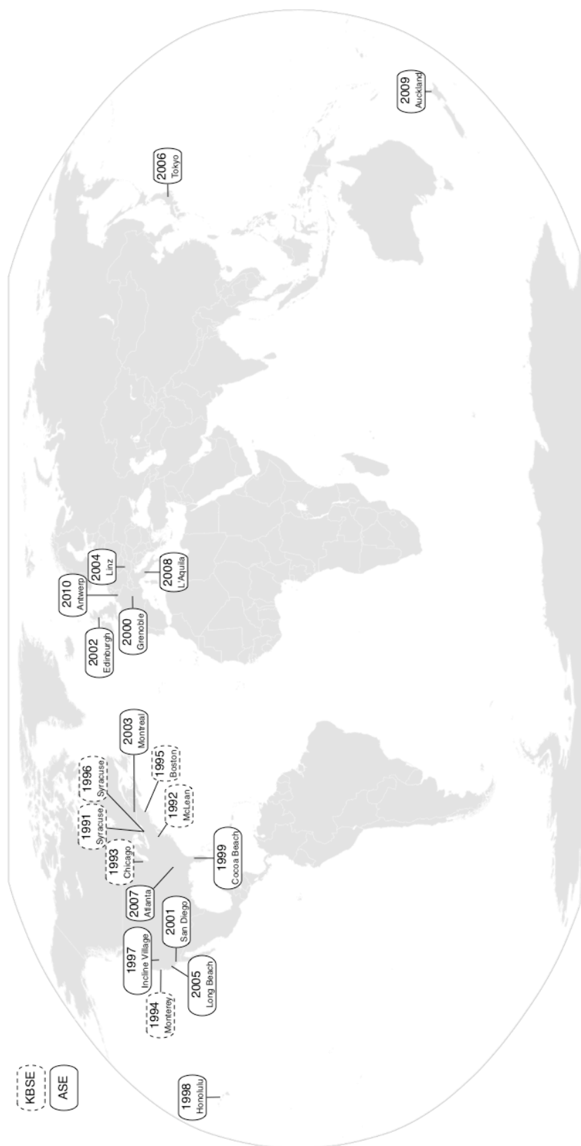
Past KBSE and ASE locations